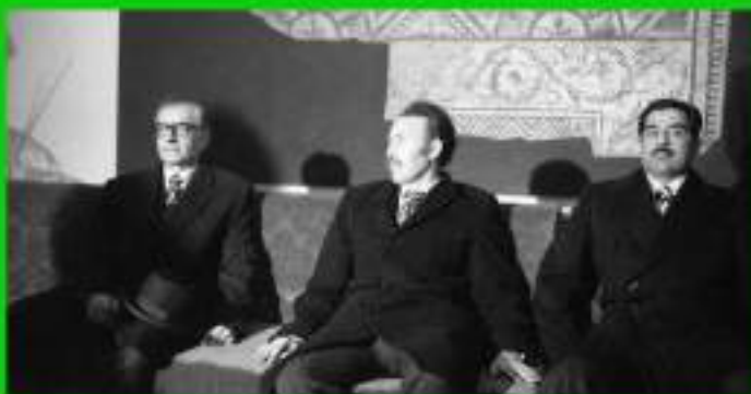
Algerian President, Houari BOUMEDIENE bringing together Heads of state of Iran and Iraq, 1975.

Principles and ideals anchored in Algerian foreign policy have constantly inspired the trust of its partners, be it at the regional or the global levels.