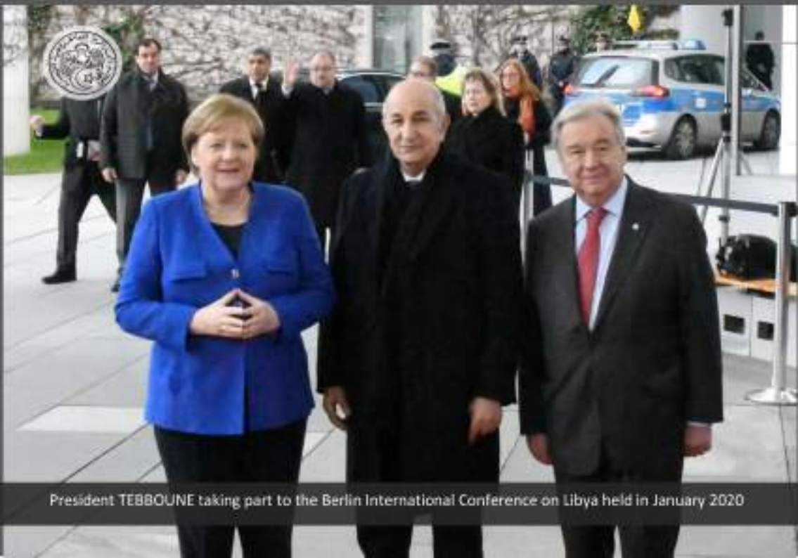
President TEBBOUNE taking part to the Berlin International Conference on Libya held in January 2020

This vision allows a reinvigorated multilateral action to by-pass the biased narrative driven by the narrow prism of selfish considerations and to strengthen international cooperation and solidarity by reactivating and reinforcing the existing mechanisms in a more efficient way.