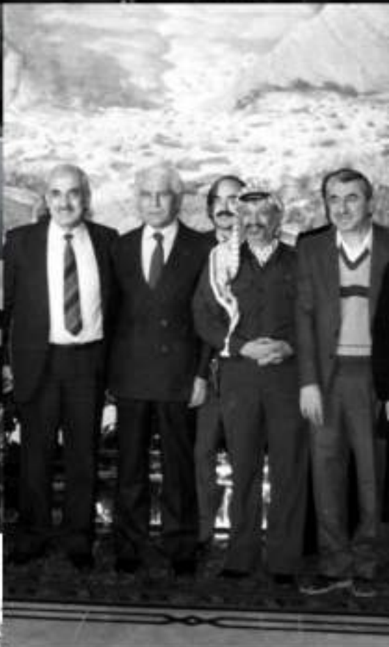
Leaders of anti-colonialism and anti-Apartheid visiting Algeria, the Mecca of Revolutionaries.