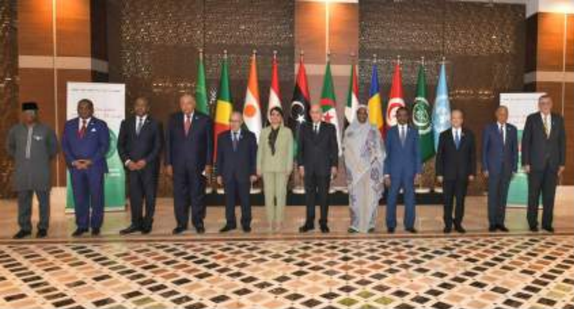
Meeting of neighboring countries of Libya, Algiers; August 2021.

Algeria strongly supports the Libyan led and Libyan owned political process under the auspices of the UN, to uphold the cease-fire and implement the plan of action for the withdrawal of foreign fighters and mercenaries so to help the brotherly Libyan People restoring stability trough the holding of national elections and to preserve its unity and sovereignty.