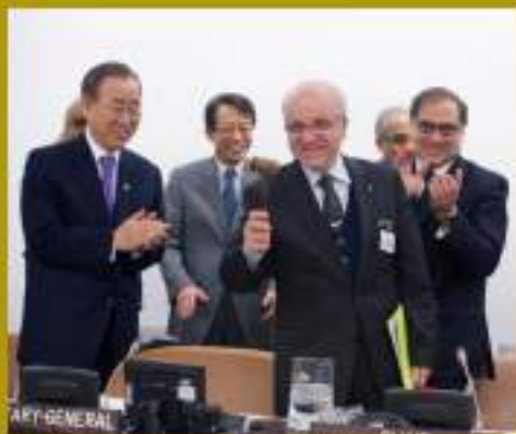
Algeria's Chairmanship of the G77 + China, 2012

collective economic interests and enhance their joint negotiating capacity on all major international economic issues within the United Nations system, and promote South-South cooperation for development.