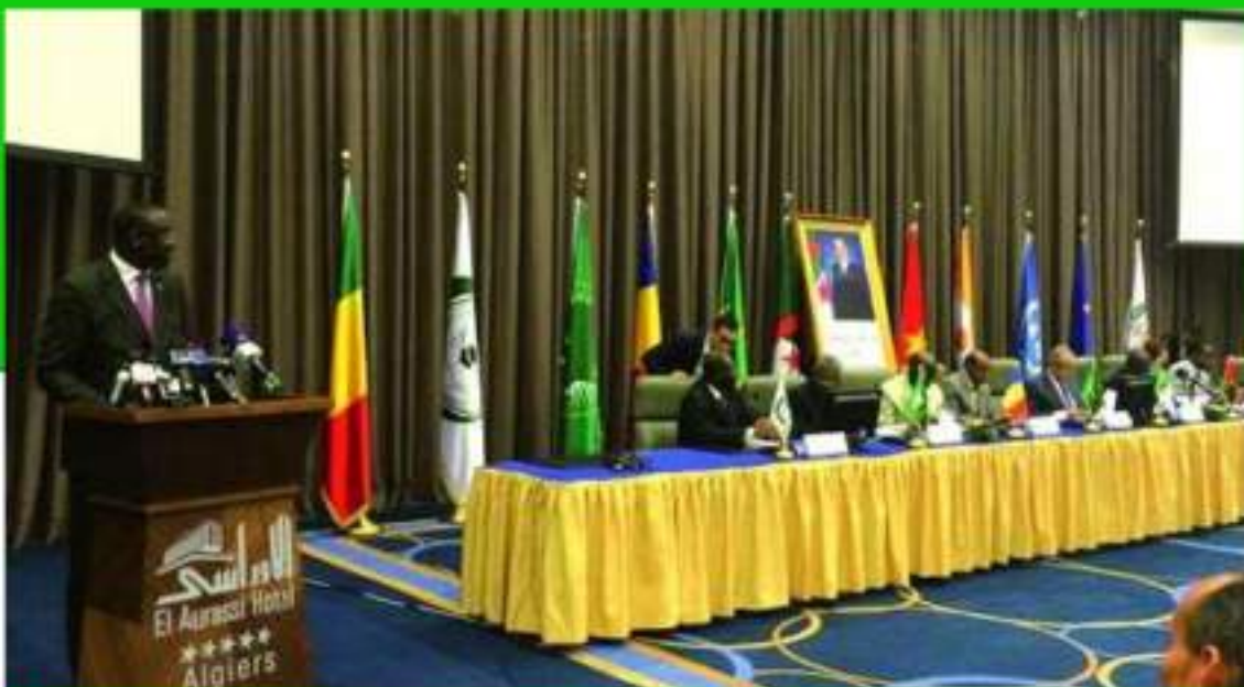
Algiers negotiation process leading to the peace and reconciliation Agreement in Mali, Algiers 2014.

Algeria's leading role in the African Union Peace and Security Council or its active role within its vital sphere are, among others, illustrations of its established and trusted mediation tradition.