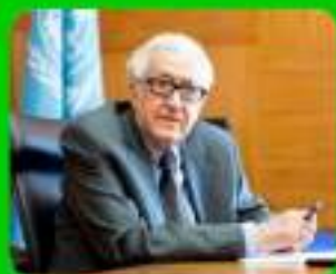
Mr. Lakhdar IBRAHIMI

Eminent Algerian diplomat who assumed several high level positions at the UN system and was lauded for his report of the Panel on UN Peace Operations (commonly known as the IBRAHIMI Report)