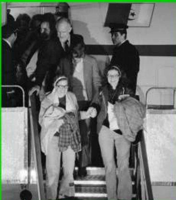
American hostages arriving to Algiers International Airport after 444 days of retention, 1981.

In 1975, a peace agreement was signed in Algiers between Iraq and Iran that ended a long dispute between the two countries.